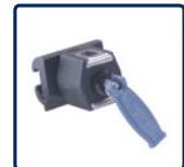
Easy Lock Socket #A-40022 (2 Required)

Please see "Instructions For Use" documents for individual accessories.