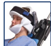
Universal Head Positioner #A-90022