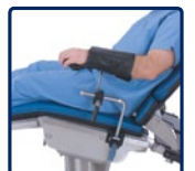
LPS Arm Support #A-90002