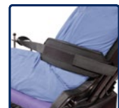
Counter-Traction Strap #A-90015