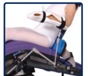
Intraoperative Arm Positioner #A-92000