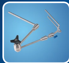
Intraoperative Arm Positioner (A-92000)