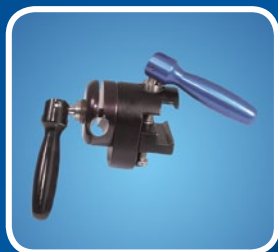
Arm Positioner Clamp (A-92002)