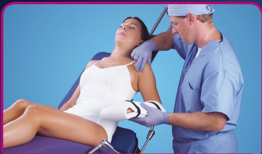
Unlimited surgical site access in the sterile field.