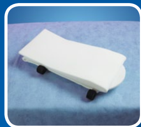
Intraoperative Arm Positioner - Sterile Disposables (Case of 10) (A-92001)