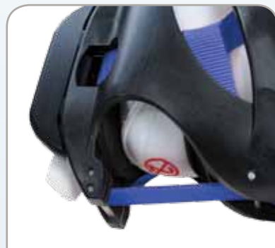
Active Heel™ Technology Accommodates Many Foot Sizes