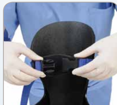
Easy to Use Buckles