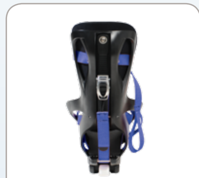
Ratcheting Mechanism Provides Precision