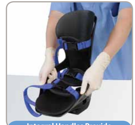
Integral Handles Provide Easy Patient Positioning