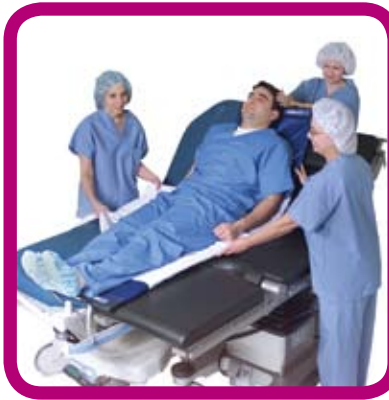
Makes Fowler-Position Transfer a Snap!