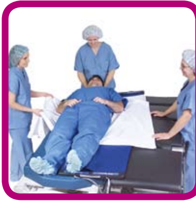
No Lifting Required!