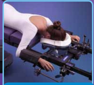
#A-70000 with C-Prone