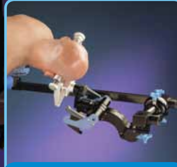
#A-70002 with C-Flex