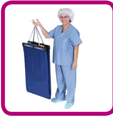
Ultra-Lightweight! Short Board is 3 lbs. (1.5 kg) Long Board is 6.3 lbs. (3 kg)

#A-83000 Long Patient Transfer Board 71" x 20" (180 cm x 50 cm)