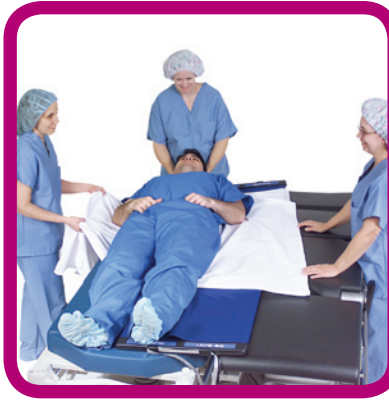
No Lifting Required!