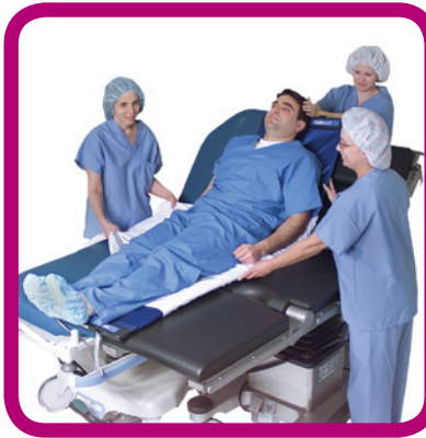
Makes Fowler-Position Transfer a Snap!