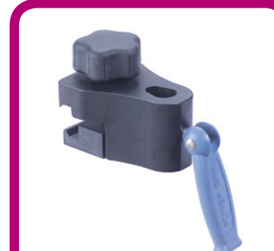
For Round Posts