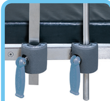
For Rectangular Blades