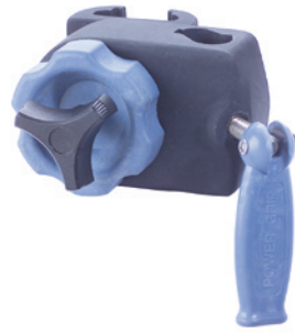
For Rectangular Blades