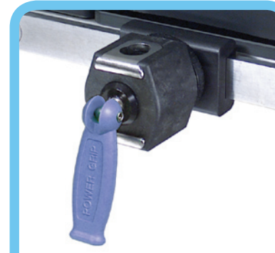
For Round Posts

#A-40015 Universal Accessory Clamp (US Only)