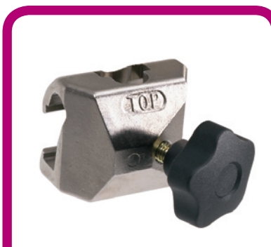
For Rectangular Blades